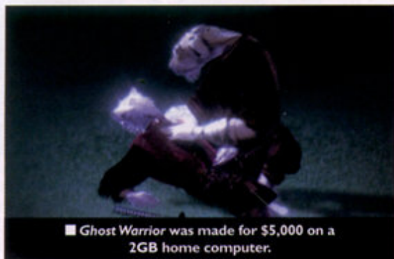
■ Ghost Warrior was made for $5,000 on a 2GB home computer.