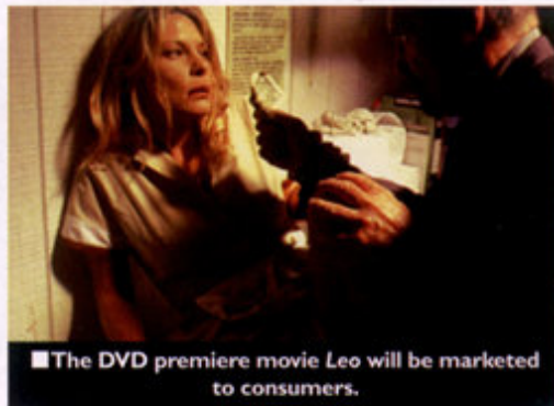
■ The DVD premiere movie Leo will be marketed to consumers.

Entertainment officials are developing what they call an ambitious promotional plan for their May release of the Southern-set drama Leo .